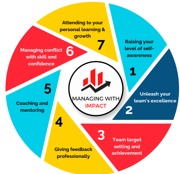
The modules of the Managing with Impact Program